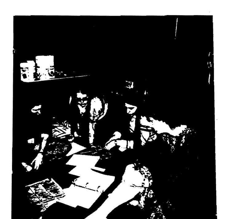
THEN THERE WAS THE PAPER PATTERN, THE CLOTH PATTERN, AND FINALLY -

"You don't think it's perhaps a trifle long?